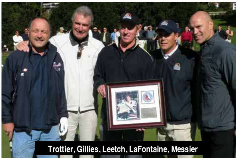
Trottier, Gillies, Leetch, LaFontaine, Messier

Leetch and his wife are raising their three children in the Boston area and he enjoys helping out at friend's charity events. His inclusion at Deepdale was a treat for all the participants.